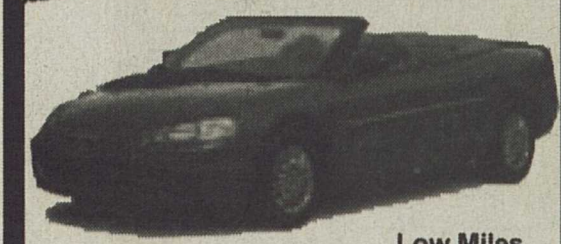
Low Miles, Convertible. 2003 CHRYSLER SEBRING $12,995 +TTL