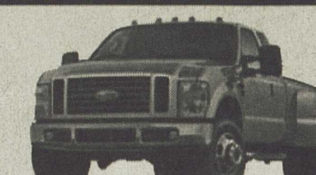
NEW! 2008 DIESEL TWIN TURBO'S PRICED TO MOVE!