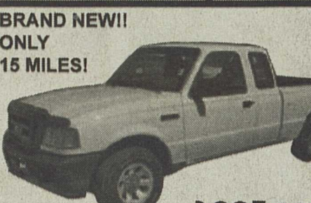
BRAND NEW!! ONLY 15 MILES! $12,995 $2,500 REBATE 2007 FORD RANGER