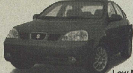
Low Miles, Warranty. 2006 SUZUKI FOREZA $12,995 +TTL