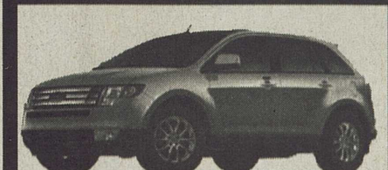
NEW! 2007 EDGE PRICED TO SELL!