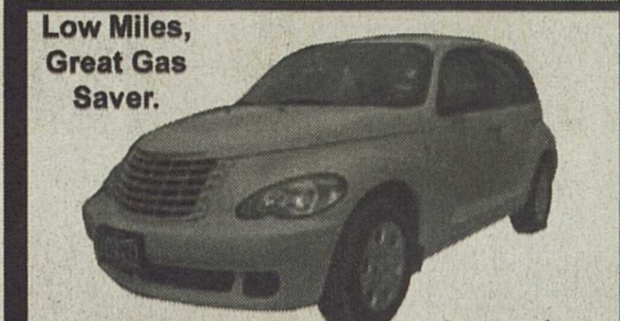
Low Miles, Great Gas Saver. $12,995 +TTL 2006 CHRYSLER PT CRUISER